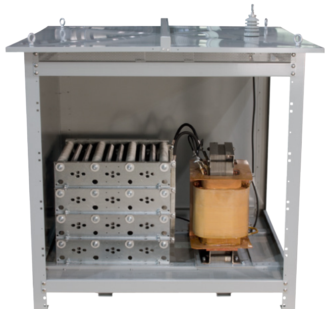
Post Glover 2400kV - 240V GTR with Stainless steel resistor banks and Type 3R powder coat painted enclosure

Post Glover's GTR product line is designed for applications on systems up to 15kV. Secondary voltage is typically 240 volts, and resistors are designed according to customer specification. Typical construction is a dry type transformer with a secondary resistor mounted in a common enclosure.