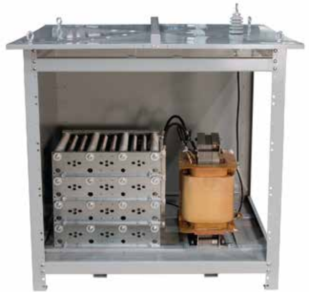
Post Glover 2400kV – 240V GTR with Stainless steel resistor banks and Type 3R powder coat painted enclosure

If the system has a neutral which is available, a single phase distribution transformer can be used in conjunction with a loading resistor to provide high resistance grounding. This is particularly well suited for grounding of generators, in that it allows the system to operate like an ungrounded system under normal conditions, while still retaining the ability to limit ground fault current. The primary of the transformer is connected from the system neutral to ground. The loading resistor is connected across the transformer secondary. The resistor is normally sized to allow a primary ground fault current in the range of 2 to 12 amps and is typically rated for either one minute or continuous duty. The transformer should be sized accordingly, with a primary rating equal to the system line to neutral voltage and the secondary normally rated 240 or 120 volts.