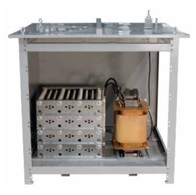
Post Glover 2400kV - 240V GTR with Stainless steel resistor banks and Type 3R powder coat painted enclosure

If the system has a neutral which is available, a single phase distribution transformer can be used in conjunction with a loading resistor to provide high resistance grounding. This is particularly well suited for grounding of generators, in that it allows the system to operate like an ungrounded system under normal conditions, while still retaining the ability to limit ground fault current. The primary of the transformer is connected from the system neutral to ground. The loading resistor is connected across the transformer secondary. The resistor is normally sized to allow a primary ground fault current in the range of 2 to 12 amps and is typically rated for either one minute or continuous duty. The transformer should be sized accordingly, with a primary rating equal to the system line to neutral voltage and the secondary normally rated 240 or 120 volts.